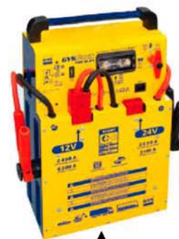
Gyspack Pro 12.24 Can be moved without Its trolley