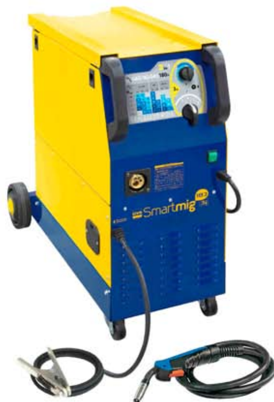
Machine with accessories – ref.033412 MIG Torch 150A 3m and earth clamp 3m (Flowmeter not included).

Ideal settings are indicated, just select the type and diameter of wire used, then the thickness of the metal. The SMART control panel makes it easy to set the voltage (4 positions) and the wire speed.