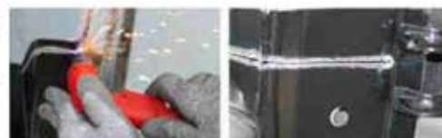
STEEL : 10 mm max ALU : 8 mm max (Speed = 9 cm / min at 30A)